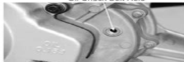
Oil Check Bolt Hole