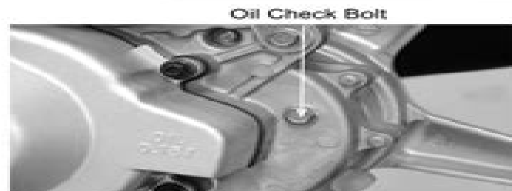
Oil Check Bolt