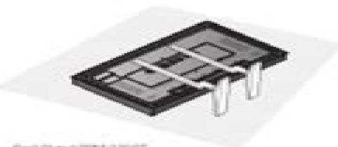
Part No: 40084-20007