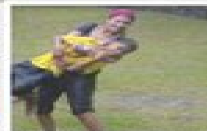
Back to the Philippines Jan 2012!

I will be in the Philippines January 14-29th, please pray the hearts of the Filipinos are open!