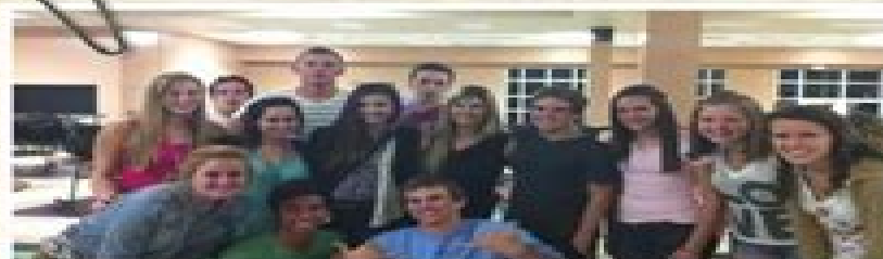
After sharing the good news with some of the Timber Creek High School students.