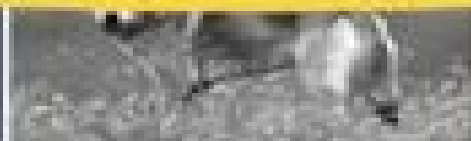
Original - Reproduced or Reproduced?