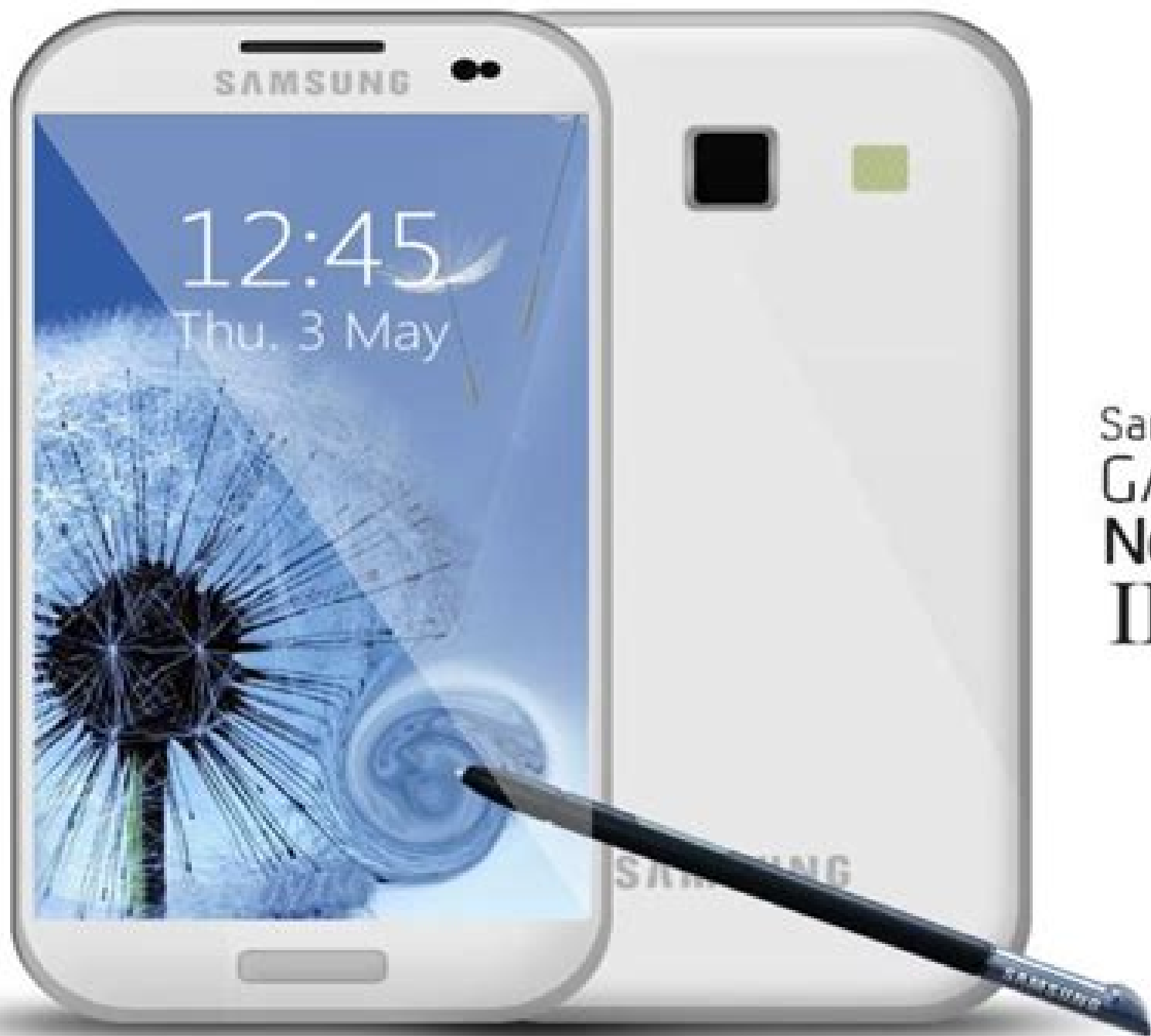
Samsung GALAXY Note II