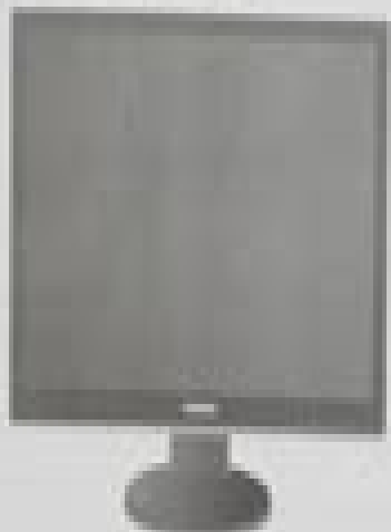
Monitor & Bezel Assembly (With Bezel)