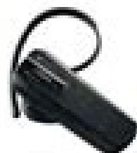
Jabra EXTREME 2