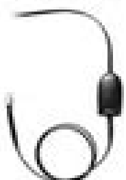
Jabra Link 1040