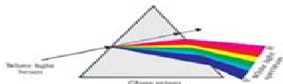
Figure 11.5 Dispersion of white light by the glass prism