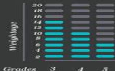
Operations and Algebraic Thinking (OA)