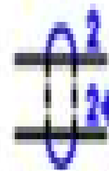
Cable with Shield (all 2nd)