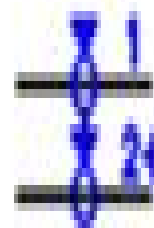
Shield Tied Back