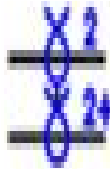
Shield (All 2nd+)