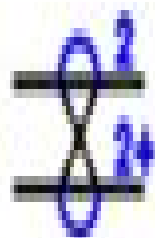
Twisted Pair with Shield (...)