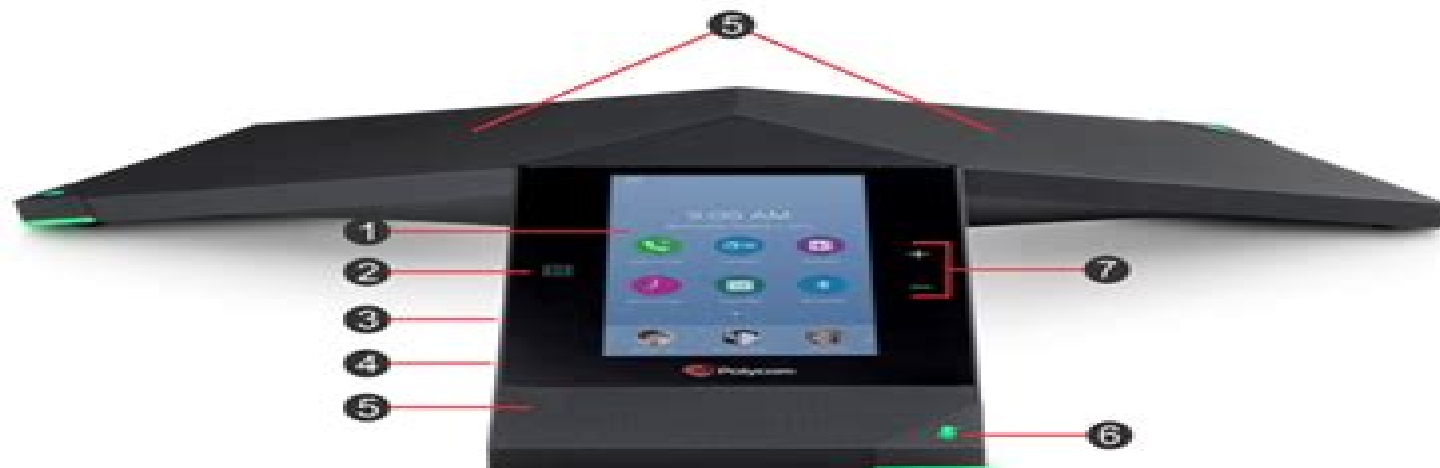
RealPresence Trio 8800 hardware features

The following figure displays the hardware features on the RealPresence Trio 8800. The table lists each numbered feature shown in this figure.