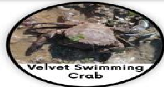
Velvet Swimming Crab