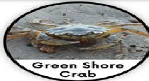
Green Shore Crab