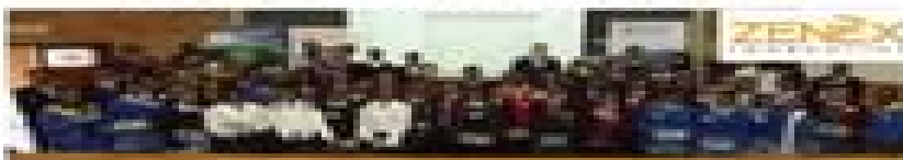
Learners attending the Winter School Programme at Missionville campus