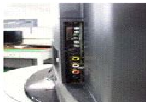
Board with missing plastic cover

Note: Consult the Samsung Service Website at ( www.service.samsungportal.com ) for the Service Manual and other information on this produ