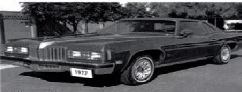
1977 Grand Prix

Pontiac- the leader of the performance pack. No other automobile has done more for high performance than Pontiac. In the beginning there was the GTO, and as other manufacturers were shying away from high powered big engines, Pontiac step up to the plate and hit a home run in 1973 with the 455 Super Duty. The debate may go as to what was the best car, but there is no doubt that Pontiac was the Alpha and Omega of the muscle cars.