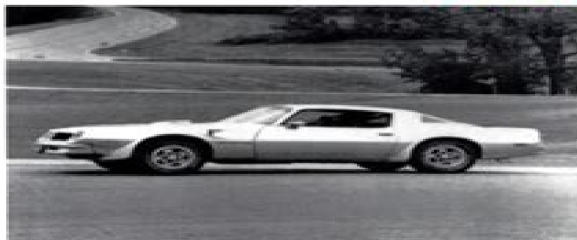
1976 Trans Am