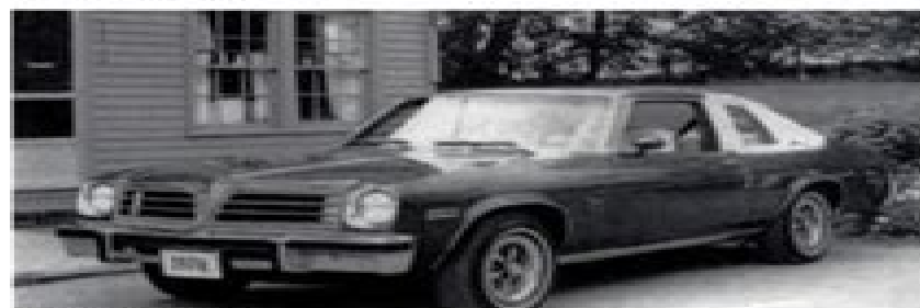
1976 Ventura II