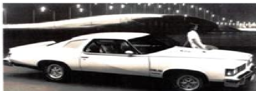
The last of the muscle cars the 1977 Can Am

Pontiac- the leader of the performance pack. No other automobile has done more for high performance than Pontiac. In the beginning there was the GTO, and as other manufacturers were shying away from high powered big engines, Pontiac step up to the plate and hit a home run in 1973 with the 455 Super Duty. The debate may go as to what was the best car, but there is no doubt that Pontiac was the Alpha and Omega of the muscle cars.