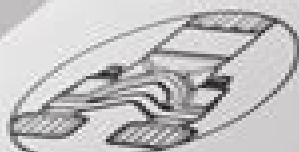
Universal Dock with Clamp

3. Orient the Universal Dock by loosening the center plastic locking ring. Rotate under the aluminum disk and rotate it counter- clockwise. Once placed in the desired orientation, tighten the locking ring by rotating it clockwise until you feel a stop.