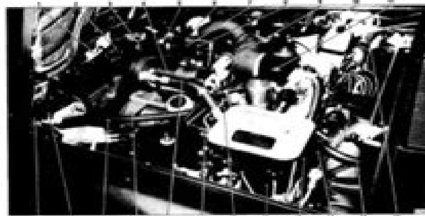
the 100 lowest rates of positive commitment: from 1990