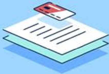
Credit card applications