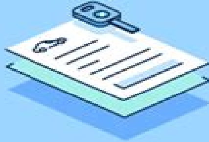
Auto loan applications