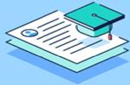
Student loan applications