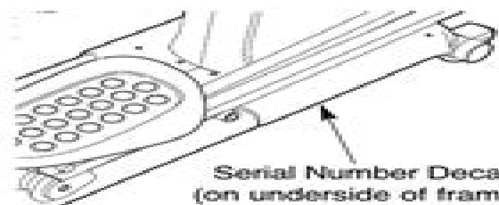
Serial Number Decal (on underside of frame)

Write the serial number in the space above for reference.