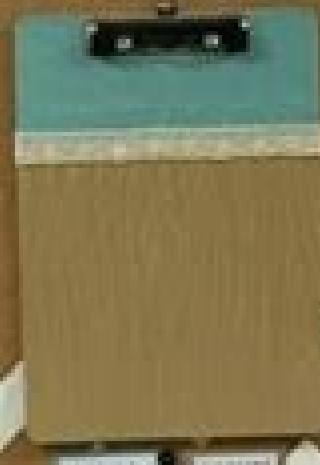
Young Men & SCOUTS