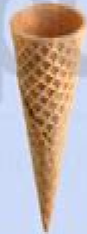
Ice Cream Cones