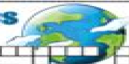
Plate Tectonics Crossword