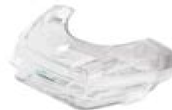
Water Chamber (Alternative option available)