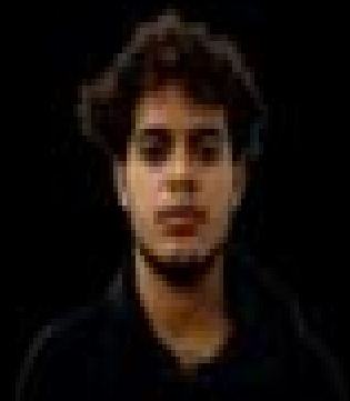
Conviction for Sexual Assault to a minor