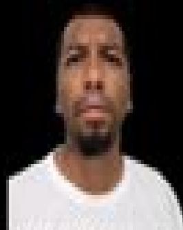
Conviction for Aggravated Sexual Assault of a child