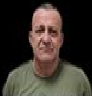
Conviction for Sexual Assault to a minor 2nd Degree