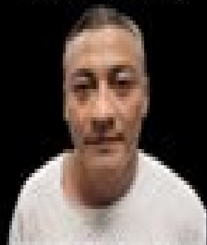
Conviction for Sexual Assault to a minor