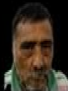
Conviction for Aggravated Sexual Assault to a minor