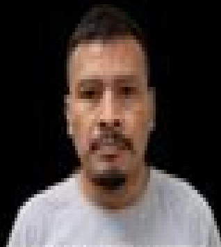
Conviction for Rape 1st Degree to a minor