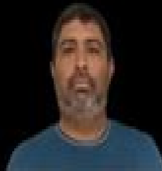
Felony Conviction for Enticing a Child with Intent