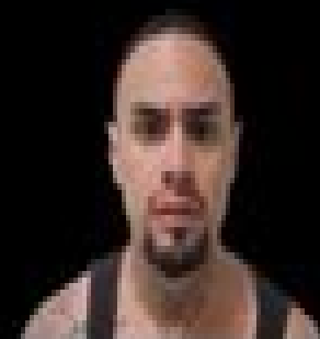
Conviction for Aggravated Sexual Assault to a minor