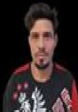
Conviction of Sexual Assault Sodomy