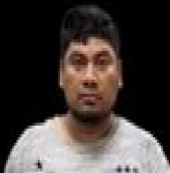
Conviction Idecency with a child Sexual Contact