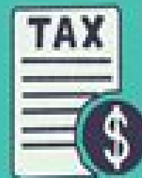
Earned Income Tax Credit