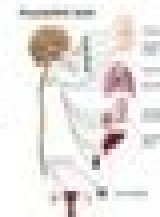
Autonomic Nervous System