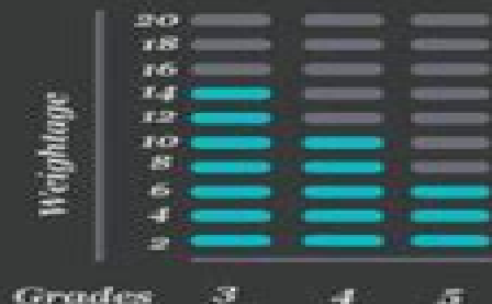
Operations and Algebraic Thinking (OA)