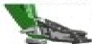
John Deere Part # 150109 List $15.00