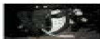
Short Low Profile Tail with Kinge Bracket