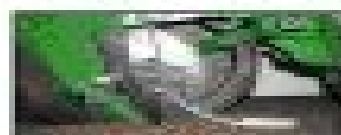
Short Low Profile Tail with Universal Bracket