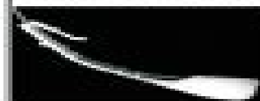
Quick Attach Keeton Tail-Standard