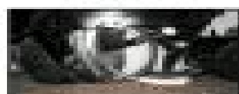
Quick Tube Tail with Kinge Bracket