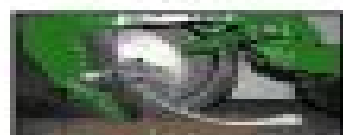
Standard Dry Tail with Universal Bracket