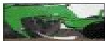
Quick Tube Tail with Universal Bracket