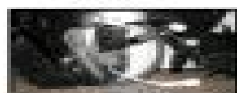
Standard Dry Tail with Kinge Bracket