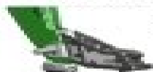
John Deere Part # 150109 List $15.00