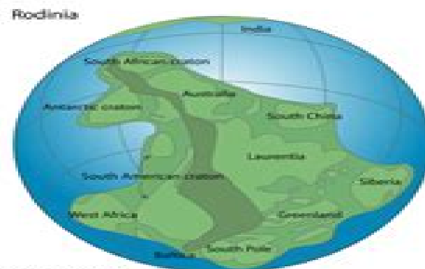
The supercontinent Rodinia 1.1 billion years ago

Plate tectonics: Smaller microcontinents collided to create bigger supercontinents , which resulted in the formation of massive mountain ranges. An active period of convergence was between 1.5 million and 1.0 million years ago. Cratons collided with microcontinents and oceanic island arcs to form Laurentia , which is part of the supercontinent Rodinia . Around 750 million years ago, oceans began forming in between continents as the result of Rodinia's disintegration.