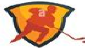
POWER PLAY HOCKEY