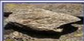
The Mica Group

is a variety of Zoisite. It is valued as a gem stone and has the chemical formula \text{Ca}_2\text{Al}_2\text{Si}_2\text{O}_{10}(\text{OH}) .