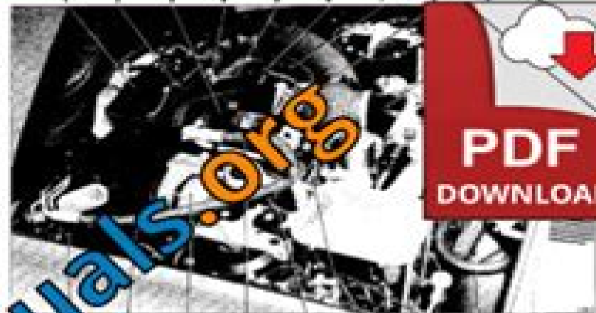
Fig. 10. Increased value of engine concentration. Note: same

4. The overall message in the research needs further refinement, and should be taken into account in the papers in the volume on the future research strategy.