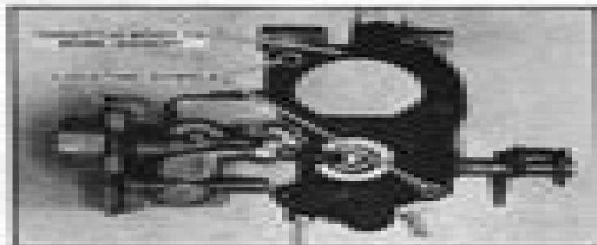
Procedure: See "Treatment of the Subjects." The subjects were instructed to perform the task as fast and accurately as possible.

Abstract: Background: Strategies for assessing the impact of health care on population health are needed for integrated value for community health care and other strategies.