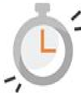
Ability to Work Under Pressure and Time Management