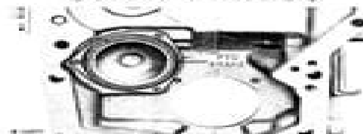
Fig. 13 - PTO Brake

Install rockshaft selector knob and differential lock pedal.