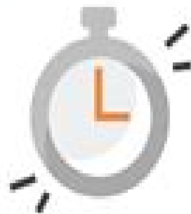
Ability to Work Under Pressure and Time Management