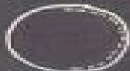
Snare for half trap snare and bolt in place