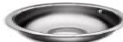
18" CONE TABLE CUT-OUT = 18"