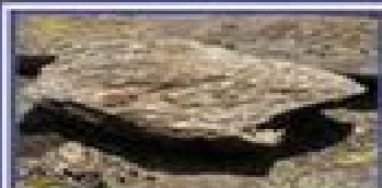
The Mica Group

is a variety of Zoisite. It is valued as a gem stone and has the chemical formula \text{Ca}_2\text{Al}_2\text{Si}_2\text{O}_{10}(\text{OH}) .