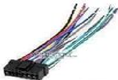
Sony 16 Pin