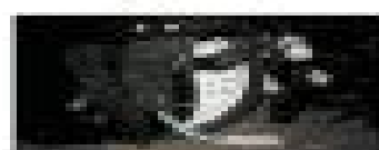
Short Low Profile Tail with Kinge Bracket