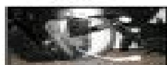
Standard Dry Tail with Kinge Bracket