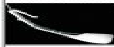
Quick Attach Keeton Tail-Standard