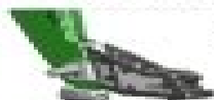
John Deere Part # 150109 List $15.00