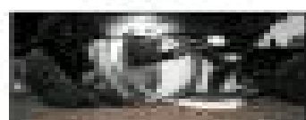
Quick Tube Tail with Kinge Bracket