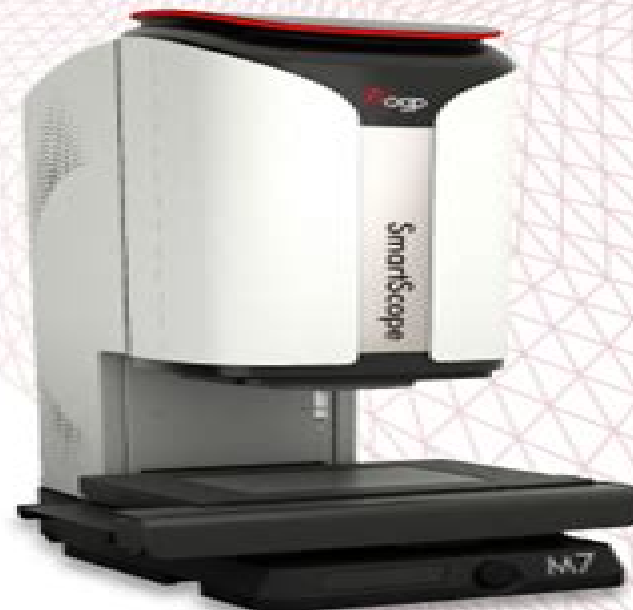
Equipped with optional scanning probe and TTL Laser.