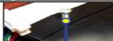
Fig. 5 - Motor