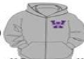
#9 GREY FULL ZIP PRINT