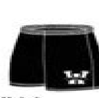
#11 BLACK DRYFIT SHORTS - PRINT