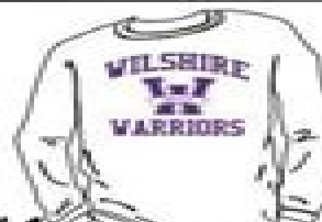
#4 WHITE LONGSLEEVE T