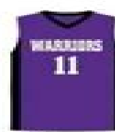
#12 Jersey BLACK& Purple

Name: _____ Teacher: _____ Room #: _____