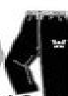
#10 BLACK SWEATPANTS PRINT