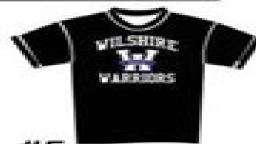
#5 BLACK T-SHIRT - DRYFIT