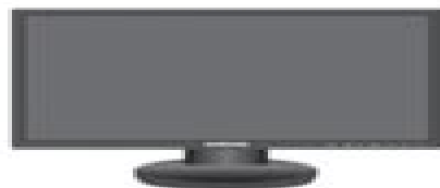
Monitor & Simple stand