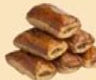
Sauceijzenbroodjes en worstenbroodjes