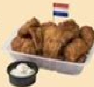
Lekkerbekje en Kibbeling