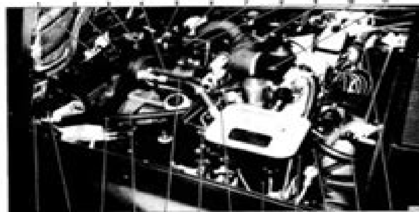
Fig. 10 Normal view of occlusal contact: lower jaw