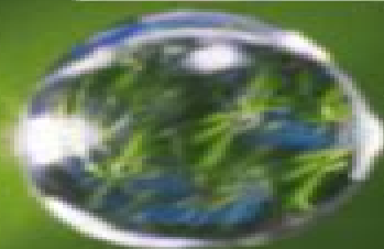
Spherical water droplet